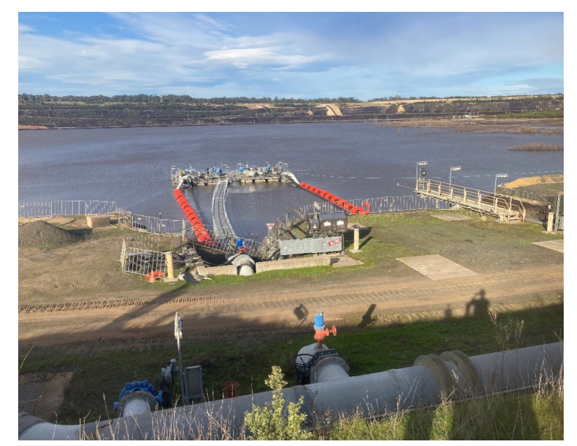
Figure 2: Fire Service Pump Infrastructure to Remove Water From the Mine to the Latrobe River

Should you require any further information on this matter, please contact us on 1800 574 947 OR email us on community.yallourn@energyaustralia.com.au