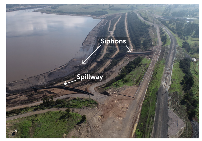
Figure 1: Aerial photo of Spillway and Siphon Location which feed water from the Morwell River to the Mine

Previous emergency discharges have been found by independent Environmental Risk Specialists to be a temporary and low risk to the receiving river environment.