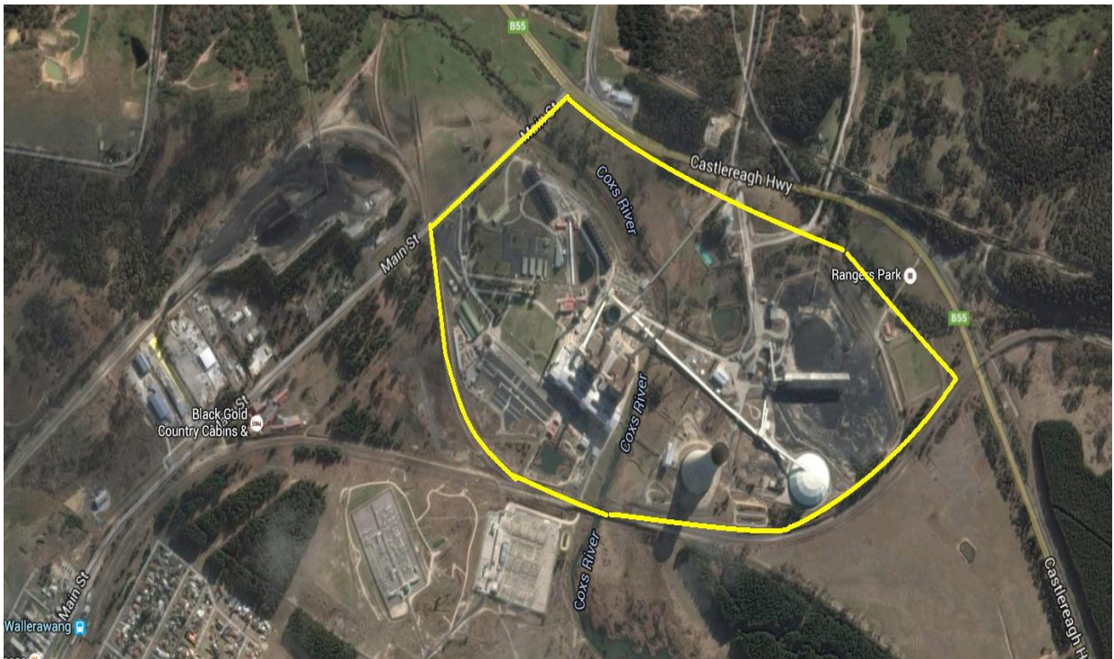
Figure 2: Aerial photo of the Wallerawang Power Station Site